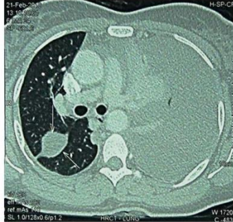
Figure 1: Chest CT showing massive pleural effusion with atelectasia in the left lung, pleural base mass in the left hemithrox, with sparing of the adjacent ribs and pulmonary nodule in the right lung.