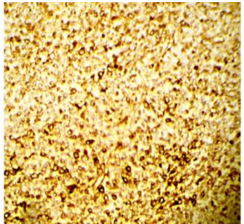
Figure 2: Biopsy of the mass showed monomorphous round cells with stippled (dispersed) chromatin and high mitotic activity (haematoxylin & eosin x 40).