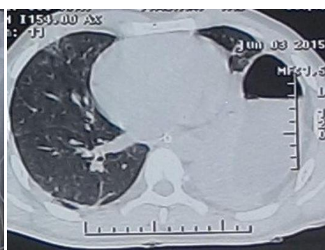
Figure 3: CT chest showed left diaphragmatic herniation.