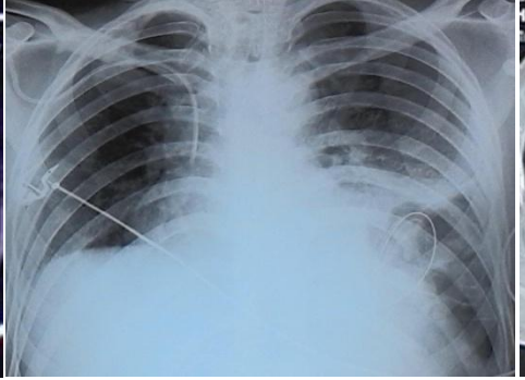
Figure 2: Chest x-ray showed loss of left diaphragmatic shadow and present of Ryle's tube in the left hemi thorax.