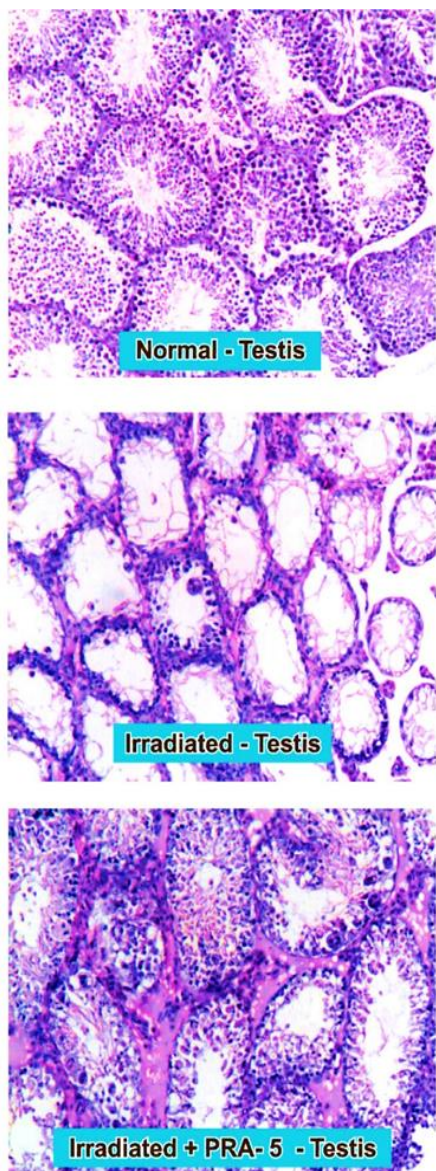
Figure 2: Histopathology of testis